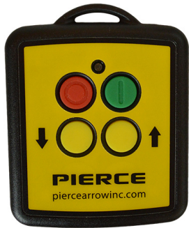
PS002 Wireless Remote transmitter