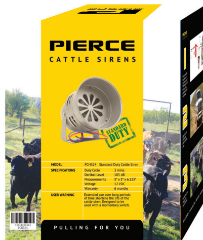
PCH324 5.63" x 5.63" x 7.15"